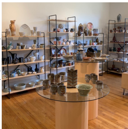
Local Artists on display in The Shop