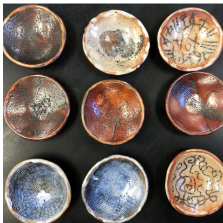
Guests at the Together at the Table Again Exhibition

Present on-site, off-site, and online exhibitions and the sale of artwork of local, national, and international ceramic artists, in solo and group format, curated or juried by professional artists in the field. Our exhibitions showcase the best of ceramic artists working in sculpture, pottery, installation, and conceptual ceramics.