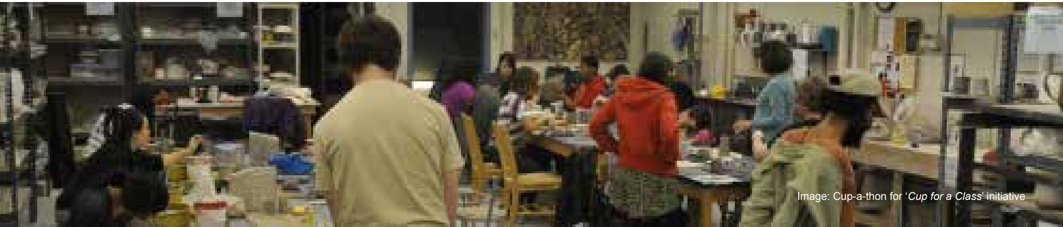
Image: Cup-a-thon for 'Cup for a Class' initiative

2012 created a platform for many excited and powerful projects, programs and opportunities for the Community Arts department and Clayworks for 2013! Keep connected to learn about or get more involved with the Community Arts department.